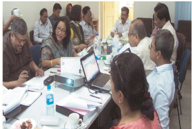
OP review meeting is conducting at PMMU with DPs

As part of the Mid-term Review (MTR) of HPNSDP , the review of the 32 OPs was conducted during May-October 2014. Detailed discussion/consultations were conducted jointly by the PW of MOHFW and DPs covering all budgets to arrive at realistic revision of each OP for the remaining period of HPNSDP. The PMMU provided background support to PW for completing review of the OPs as part of the MTR process.