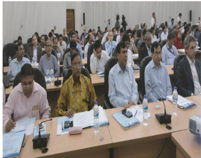
IRT is attending the Policy Dialogue conducted by MOHFW

The MTR looked at issues across the whole of the HPNSDP, and drew on MPIR and a number of reports produced to assist the MTR. The whole process was initiated by the PW and guided by the MTR Steering Committee. The IRT submitted the final report on 8th October 2014 following consultations with the stake holders and extended policy dialogue.