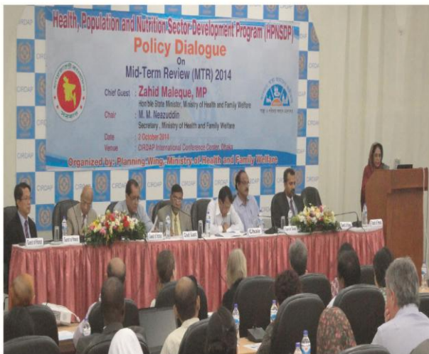
Mr. Zahid Maleque, MP and Honourable State Minister, MOHFW is attending the Policy Dialogue at CIRDAP