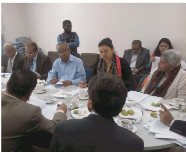
The 5th meeting of PWC held in the Conference Room of the Planning Wing, MOHFW