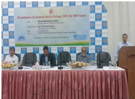
Dissemination Workshop on ESP, presided over by Secretary, MOHFW Local Consultative Group (LCG) Working Group (WG) on Health

The 13th meeting of the LCG Working Group on Health was held on 22 August 2016 under the chairmanship of Secretary, MOHFW. DP Consortium Chair graced the meeting as Co-chair. The meeting was briefed on Joint Appraisal of GAVI funded programs in 2016. Progress on preparation of the 4th Sector program was also presented in the meeting.