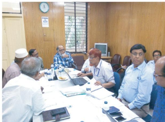
Cost estimation workshop, presided over by Joint Chief, MOHFW

The PW, MOHFW launched detailed discussion in September on estimated cost of the draft OPs of the 4th Sector Program. Three workshops on various OPs of MOHFW, DGHS, DGFP and other Agencies took place on 3 September, 21 September and 24 September 2016.