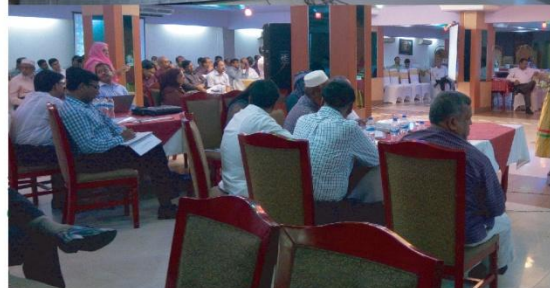
Stakeholder Consultation Workshop in connection with preparation of 4th HNP Sector Program held in Sylhet

A divisional stakeholder consultation workshop in connection with preparation of the 4th HNP Sector Program was held on 24 July, 2016 in Sylhet. The workshop was presided over by Joint Chief (PW), MOHFW. Director General, Directorate General of Family Planning (DGFP) graced the workshop as the Chief Guest. GOB Officials of all tiers of HNP services of Sylhet Division along with development partners (DPs), local government, private sector, media and civil society representatives including some adolescent boys and girls actively participated in the workshop. Recommendations made by the participants are being considered for inclusion in the relevant OP/PIP of the 4th Sector Program.