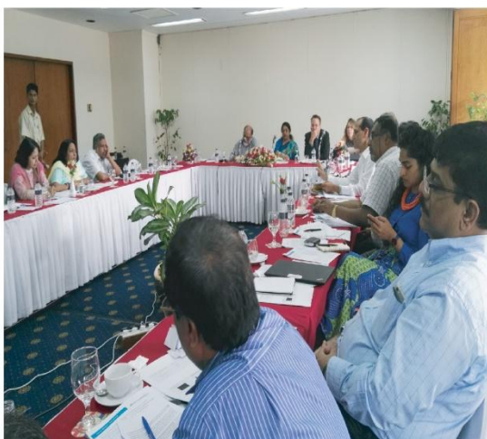
Thematic Area wise discussion meeting held in the conference hall of the Pan Pacific Sonargaon Hotel