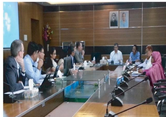
Discussion meeting with WB, presided over by Secretary, MOHFW

The 2nd Identification Mission of the World Bank took place during 04-08 August and 25-29 September 2016. The objective of the Mission was to (i) identify the technical areas of focus of the Government's HNP Strategic Investment Program that would define the boundaries of the proposed financing operation; (ii) to identify priority actions, outputs and intermediate results being defined in the PIP towards achieving those results which might include potential DLIs; and (iii) advance the World Bank-led assessments of the MOHFW's fiduciary and safeguard systems.