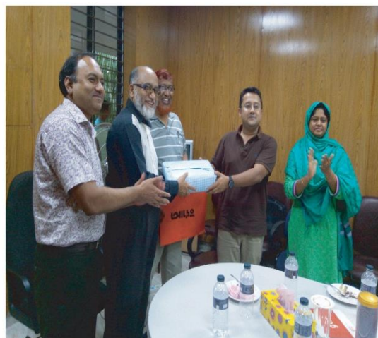
A farewell ceremony for the M&E Advisor, PMMU held in the Conference Room of PMMU