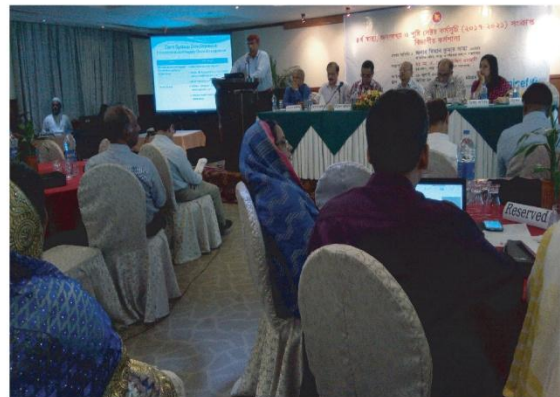
Divisional Consultation Workshop in CTG, presided over by Joint Chief (Planning), MOHFW

The 3rd stakeholder consultation workshop in connection with preparation of the 4th HNP Sector Program was held on 28 August 2016 in Chittagong. The workshop was chaired by Joint Chief (PW) having Additional Secretary, MOHFW as chief guest. GOB Officials of all tiers of HNP services of Chittagong Division along with development partners, local government, private sector, media and civil society representatives including some adolescent boys and girls attended and actively participated in the workshop. A number of recommendations came up which are being considered for inclusion in the OP/PIP of the 4th Sector Program.