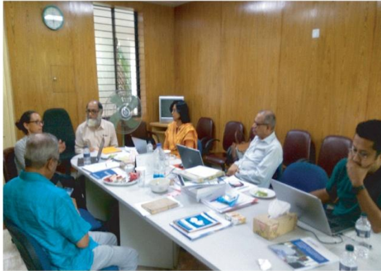
Discussion meeting with the Country Coordinator, MEASURE Evaluation