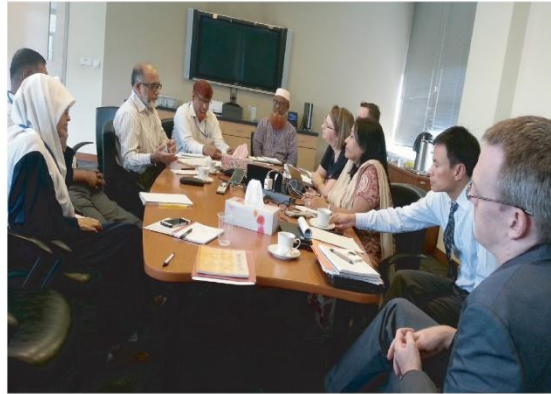
A meeting between MOHFW and the World Bank held in the Conference Room of WB

The World Bank's 1st Identification Mission took place during 01-10 August 2016. Presentations on Program for Results (PforR) and Global Financing Facility (GFF) were made by the Mission. On 02 August 2016 two consecutive meetings of the Mission took place—One with the DPs of the HNP sector and the other with the Planning Working Committee (PWC). Further discussion on PforR and Disbursement Linked Indicators (DLIs) was made in the meetings. The wrap-up meeting chaired by Secretary, MOHFW took place on 10 August 2016. PMMU-TAST assisted PW in formulating GOB's comments on the aide-memoire of the World Bank.