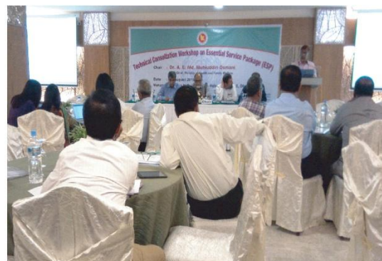
Workshop on draft ESP, presided over by Joint Chief, MOHFW