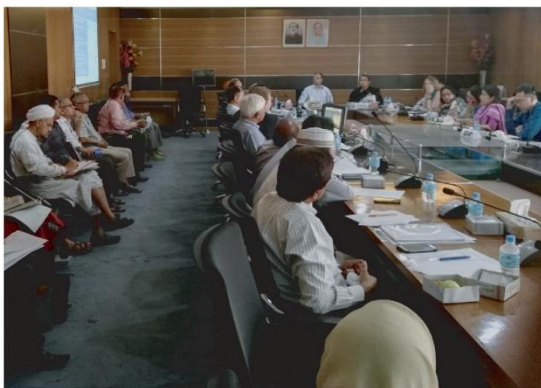
LCG Working Group Meeting, presided over by Secretary, MOHFW

The 13th meeting of the LCG Working Group on Health was held on 22 August 2016 under the chairmanship of Secretary, MOHFW. DP Consortium Chair graced the meeting as Co-chair. The meeting was briefed on Joint Appraisal of GAVI funded programs in 2016. Progress on preparation of the 4th Sector program was also presented in the meeting.